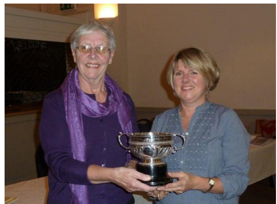
Presentation of the rose bowl to the 2010 winner

Runners up: 119 Fowlers Walk, 1 Ruskin Gardens, 29 Denison Road